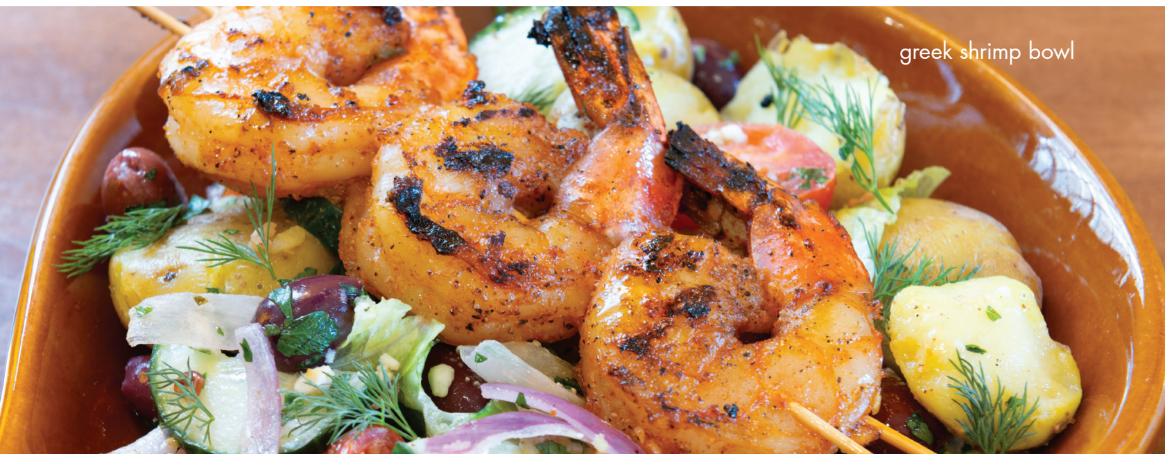
greek shrimp bowl